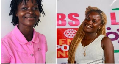
Lena Marshall Foundation (LMF) Girls Mentorship Program LMF Mentees 2022/23